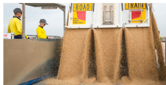
Dump & Go – Drive Over Hopper

UBB Belt Conveyor features slide-out conveyor to enable easy removal for maintenance and cleaning