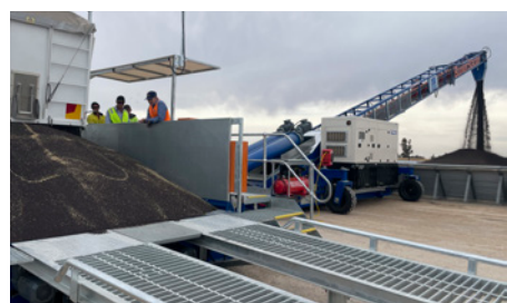
UBA model – Auger Conveyor