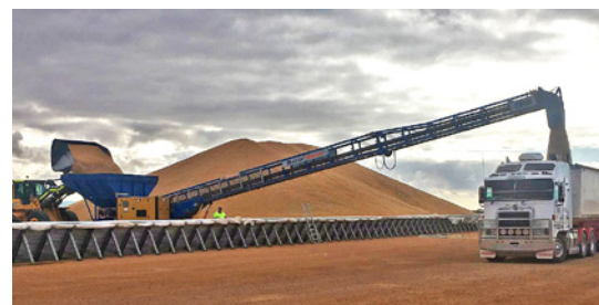
Outloading via BunkerStacker 3750 fitted with surge hopper