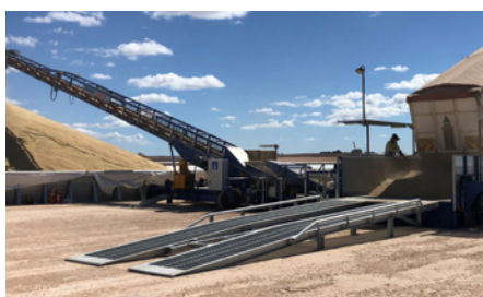
UBB model – Belt Conveyor