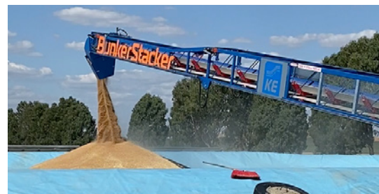
Multi-directional discharge chute