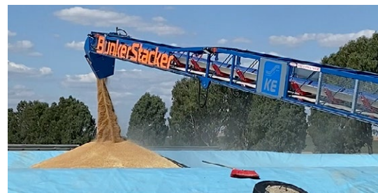
Multi-directional discharge chute to make trimming the bunker easy