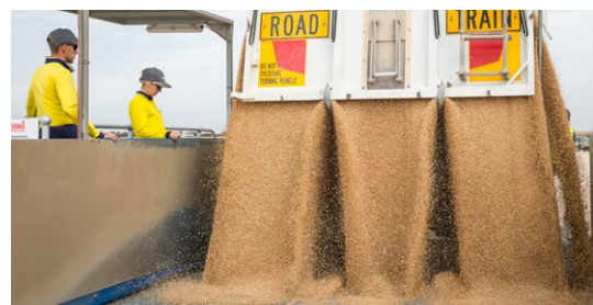
Dump & Go – Drive Over Hopper