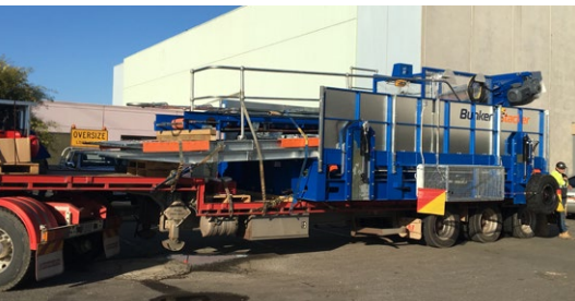
The BunkerStacker 3000 can be moved between sites on two semi-trailers

Tired of spillage and shovelling as each truck dumps? Or perhaps you are tipping slow to minimise clean up. Its time to graduate to the big league with a Big Roo BunkerStacker . Once the word gets out you have a KE BunkerStacker working on your site, grain will flow as the trucks dump and go!