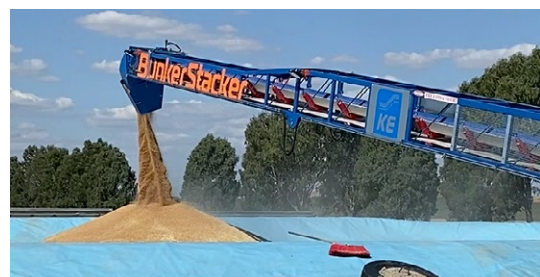
Multi-directional discharge chute to make trimming the bunker easy