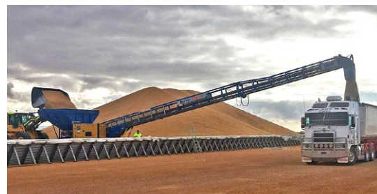
Out loading via BunkerStacker 3000 fitted with surge hopper