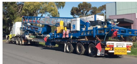
Stacker loaded ready for transport

Kilic Engineering 15 Birralee Road Regency Park, SA 5010 Australia