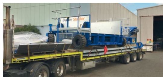
Compact DOH loaded for transport