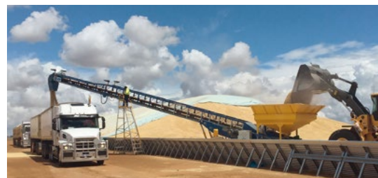
Outloading via BunkerStacker2000 fitted with surge hopper