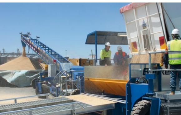
Drive Over Hopper in operation

The BunkerStacker2000 “self-propelled” Drive Over Hopper (DOH) & Stacker is designed to make unloading grain from truck trailers into a bunker quick and easy.